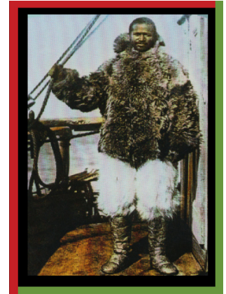
Matthew Henson, Arctic Explorer