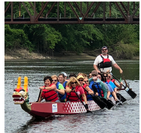
The “winning” team joyfully races to victory

On May 31st, nearly forty participants from the firm gathered at the Riverside Park Boathouse, where they received a brief history of the sport, an on-land briefing of paddling technique, skills and safety, as well as on-water commands from the staff at Riverfront Recapture. Participants then boarded two dragon boats, each holding a team of 20 people to practice what they had learned. The event, sponsored by the Diversity and Inclusion Committee, culminated in an informal dragon boat race between the two teams.