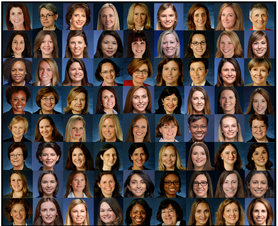
Some of the women attorneys at Shipman & Goodwin

The firm ranked #6 as one of the Best Law Firms for Female Attorneys. Law360 also named Shipman & Goodwin a Best Law Firm for Female Partners, ranking it in a tie for #10 on its list of "Ceiling Smashers." Both rankings were among firms with 150-299 attorneys, and were based on above-average representation of women at the partner and nonpartner levels. The firm was one of only two Connecticut firms in this size range to be included in either category.