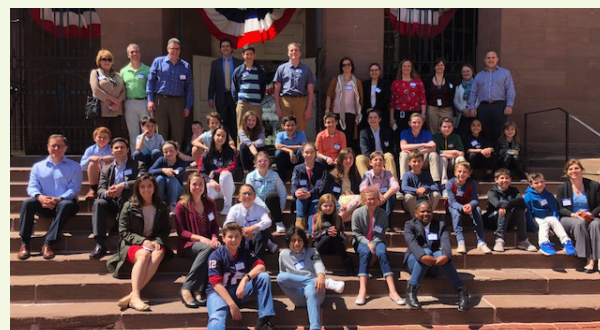
Participants and chaperones visit the Old State House in Hartford, CT for "Freedom Once Taken: The Amistad Story"

Shipman & Goodwin's Hartford office welcomed students in grades four through eight to celebrate "Take A Child to Work Day" on April 26th. The much-anticipated annual event, sponsored by the firm's Diversity and Inclusion Committee, gave many sons, daughters, nieces, nephews, grandchildren, friends and neighbors of attorneys and staff the opportunity to participate in a full day of educational (and fun!) activities. Guests took a trip to the Old State House, which included exploring the most famous trial ever to take place there through the program Freedom Once Taken: The Amistad Story . Students also participated in a mock courtroom debate and a community service project decorating flowerpots for individuals in the MARC, Inc. Residential Services program in Manchester.